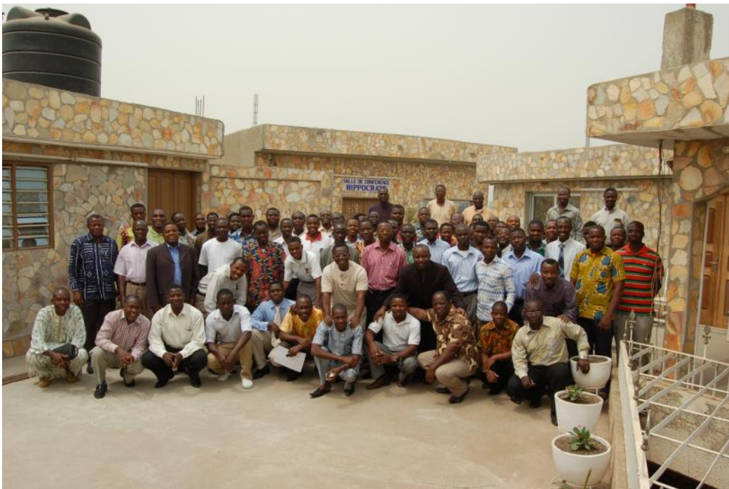
Bible Mission Conference