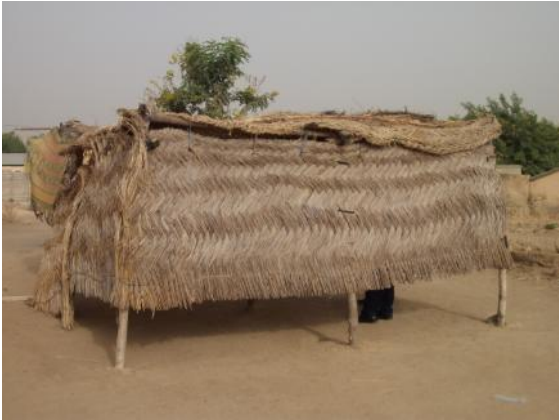
Meeting Place at Korbongou