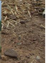
Making blocks by hand