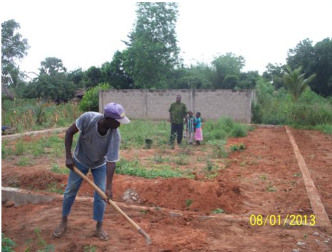
Foundation of the shelter of our third church at Kleme