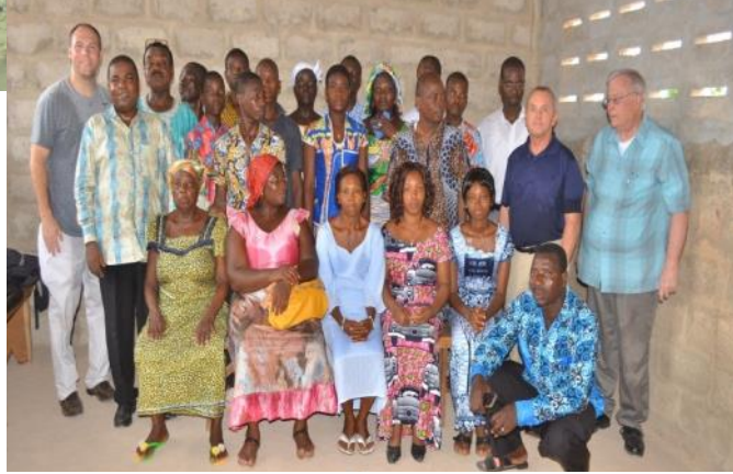
The True Baptist Church at Kleme, our third small church