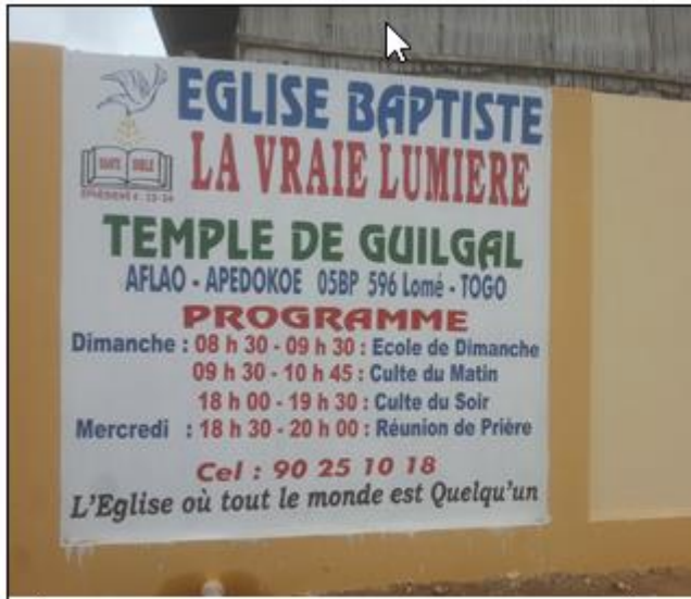
OUR CHURCH SIGN

Our Christian Academy will be open on October 17, 2016. We plan to start K-5, first grade to second grade. By the grace of God all the teachers are members of our church. We have been praying for this project and God answered our prayers.