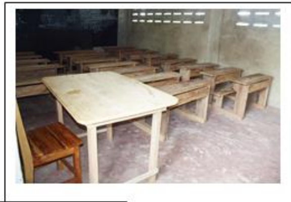
CLASSROOMS READY FOR THE SCHOOL