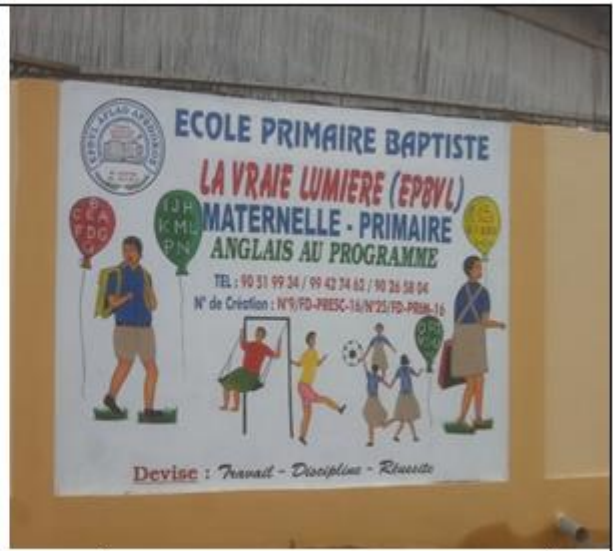
OUR CHRISTIAN SCHOOL SIGN