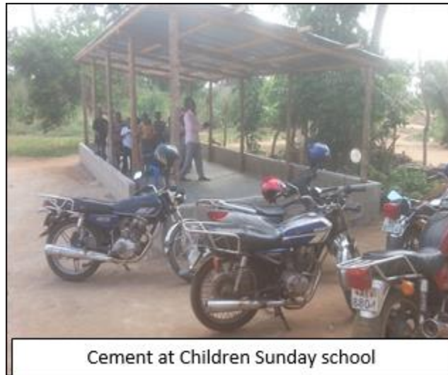
Cement at Children Sunday school